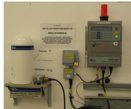
Fig 4: Installed Radiation monitor.

When the accelerators are operating and shutters open, the Optics hutches will take synchrotron radiation and bremsstrahlung. The synchrotron radiation is a high intensity beam with energy in the tens of keV range, whereas the bremsstrahlung is lower intensity but more penetrating, having an energy spectrum up to 3 GeV. Prior to taking beam, the hutches will be searched and locked by trained DLS staff. The Optics hutches are shielded with lead. Sensitive gamma radiation monitors (Fig 4) which continuously monitor and record dose rate are installed on the outer wall of the Optics hutch, opposite the first scattering element.