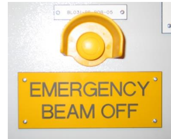
Fig 5 Emergency Beam off button.

Following sections is for information only. Emergency controller and other responsible group dealing with the incident will take following actions accordingly –