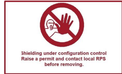
Fig 1 Sample of warning sign for PtW.

5.2 All removable radiation shielding and beamline components which have a radiation safety function, e.g. shutters and bremsstrahlung collimators, are subject to configuration control using a radiation Permit to Work (PtW) based on the DLS PtW procedure HAS-PRC-0021 2 . All such shielding and components or its covers will be painted yellow or provided with suitable signs (Fig 1) to indicate that it is subject to configuration control, and that a radiation PtW issued by the RPS is required in order to disassemble the shielding or change or remove the components. The RPS will keep a register of all shielding and components which are subject to configuration control. User labyrinths are under PSS Fortress key control rather than configuration control – the beamline is disabled if the User labyrinth key is not in its key press.