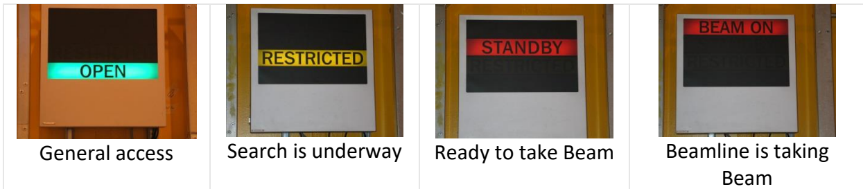
Fig 2 PSS annunciator displaying different stages in the beamline.

All entrances to hutches have an annunciator. Search door have the full annunciator as above. Service door may only have a smaller BEAM ON annunciator. Check the appropriate annunciator before opening a hutch door. The Beamline alarm panel message screen does not carry beam status information, so be sure to look for the appropriate annunciator.